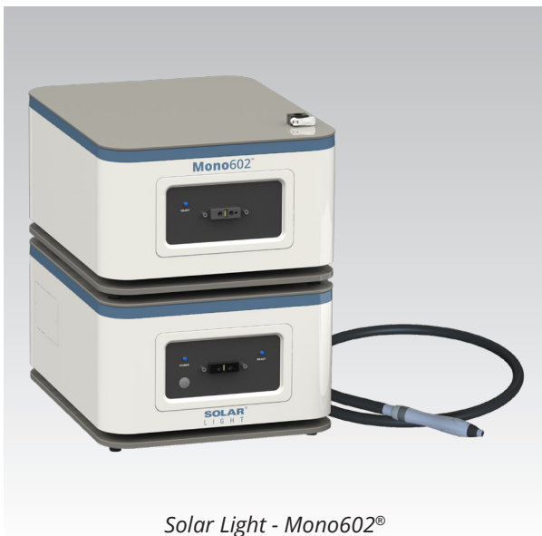
Solar Light - Mono602 ®

As the Global Leader providing the current gold standard for SPF measurements today, Solar Light has developed the fastest performing HDRS instruments on the market, keeping product research, formulation and clinical testing in mind. HDRSplus™ software is designed specifically for a clinical testing laboratory environment and simplifies all HDRS calculations.