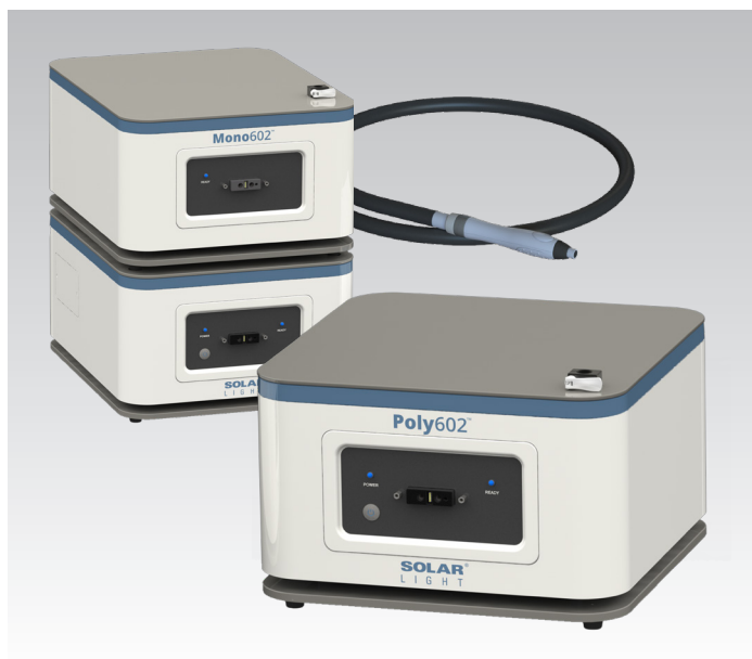
Model 602 Series - Mono602 ® and Poly602 ®